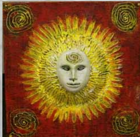
Sun by Igor