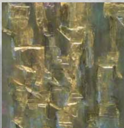
Untitled by William Sehestedt