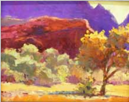
Blood Red by Kathleen Struckoff