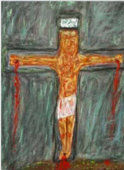
TGFGF by Carl Deaville