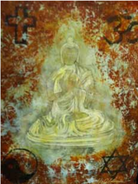
TAO by Jeffrey Oldham

The address is http://fineartamerica.com/groups/vegas-artists-guild.html