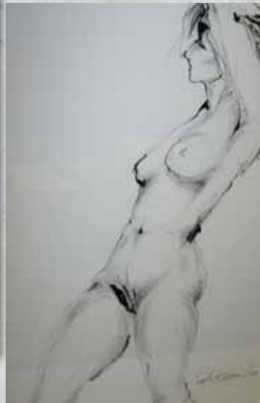
Totally at Ease by Pat Kuratmoto