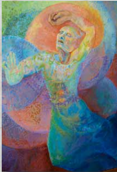
Rising Spirit by Gabbie Hirsch