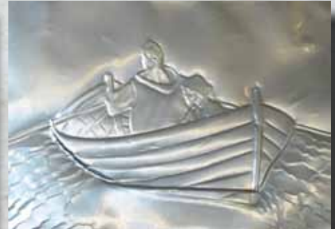
Mom & Son