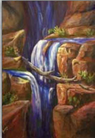
Waterfall 2 Marsha Gladding