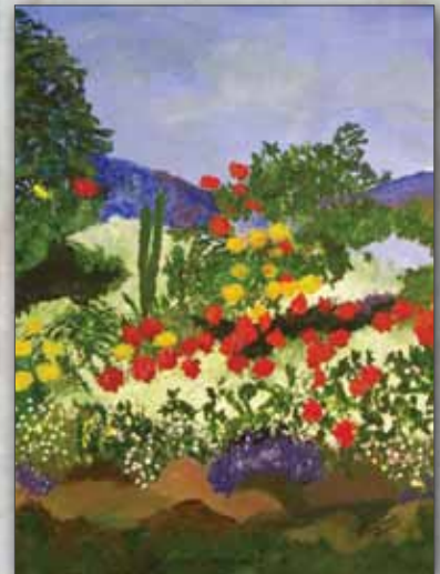
Untitled Linda Snyder