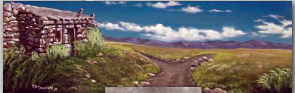
Crossroads Julie Townsend