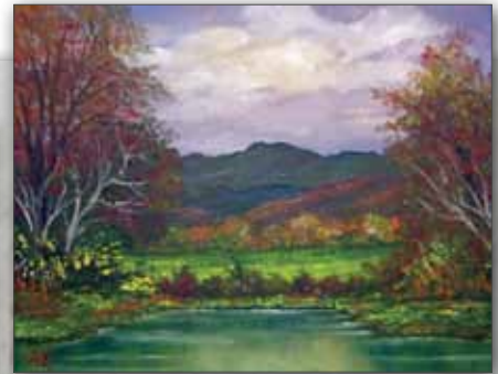
Untitled Annaliese Kielhorn